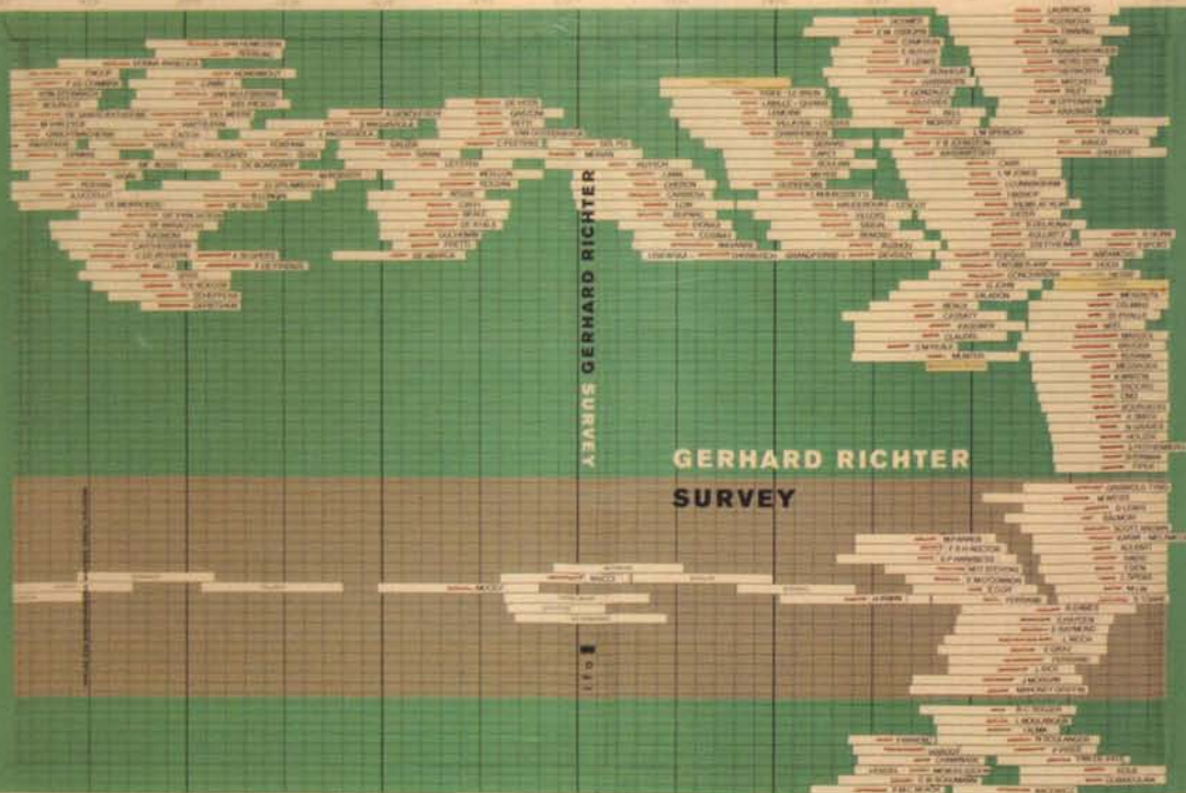
Joyce Kozloff: After Gerhard Richter, 2003, pencil, collage, marker, image 17 1/8 by 25 3/4 inches; at St. John's University, Queens.

Birgit Jürgenssen posed in small photographs dated 1977 as Untitled (Self with Fur) : a fox pelt tumbles down from the pixieish artist's own hair to cover the top part of her face. Likewise, Senga Nengudi, in photos from her ca. 1978/79 Masked Taping performance, applied long pieces of light-colored tape to her body. She is caught in a blur of motion, the tape almost giving the impression that she is on fire.