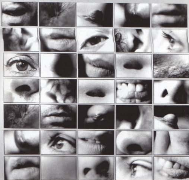
Carolee Schneemann: Portrait Partials, 1970/2004, giclée print, 44 inches square; not in show—a similar work was at Galerie Lelong.