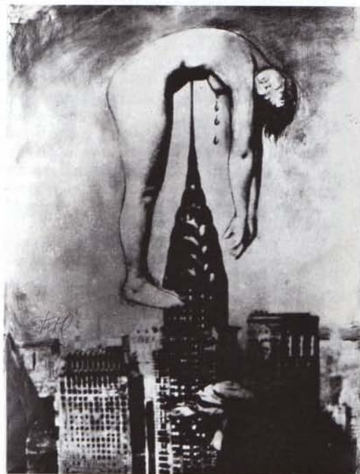
Anita Steckel: Pierced , early 1970s, photomontage, 48 by 36 inches; at Tabla Rasa .

is channeled through found-object assemblages such as Sunnyland (The Dark Side) , 1998, an old-fashioned washboard crowned by a cutout of a mammy doing laundry; below, on the corrugated grate, is a stenciled image of a lynched African-American man. Lezley Saar embraced the use of vintage materials with an autobiographic twist in her folk-art-style paintings on books and textiles. In the weathered-looking My Nature (1994), a supine female, a tree growing out of her chest, is depicted on a floral-patterned ground. One of Alison Saar's noted rough-hewn wooden carvings occupied the room's center: in Coup (2006), a nearly life-size female figure is seated, her hair braid stretching backward, blending with a cargo rope that winds around a pile of old suitcases and trunks. She holds a large scissors.