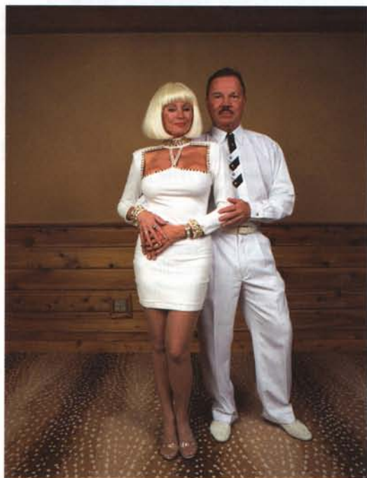
Naomi Harris: White Party Couple , 2005, C-print, 25 by 20 inches; at A.I.R.

Most selections were works on paper, with a focus on inventive use of materials. Françoise Duresse showed small-scale, strangely compelling renderings